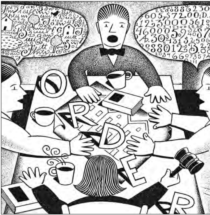
Just What is the Job...? continued from previous page